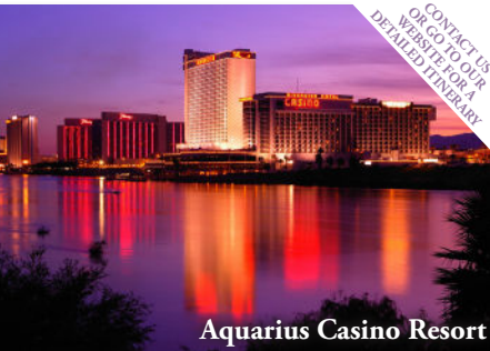
Aquarius Casino Resort

CONTACT US OR GO TO OUR WEBSITE FOR A DETAILED ITINERARY