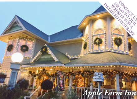
Apple Farm Inn

CONTACT US OR GO TO OUR WEBSITE FOR A DETAILED ITINERARY